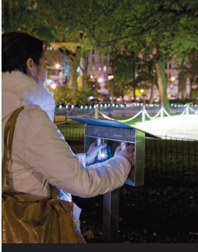
Pulse Park (Madison Square Park, New York City, 2008)

realism as any other Latin American. I'm coming more from the understanding of my work as special effects. I'm very comfortable when people see my work, and they don't necessarily think of it as art. They just say it's special effects. That's fine with me. Effectism is