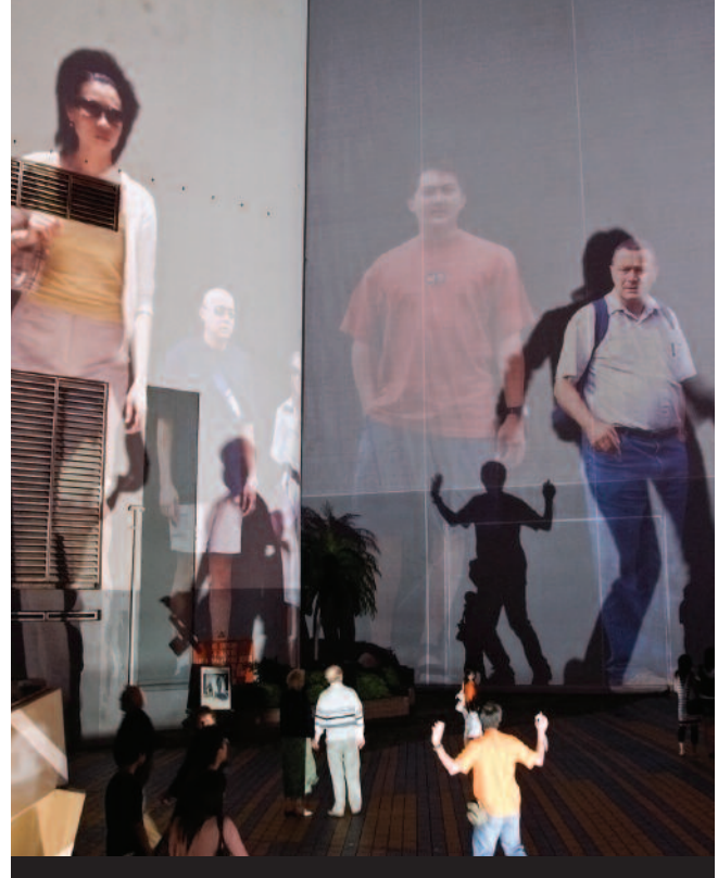
Body Movies, Relational Architecture 6 (Hong Kong, China)

After Walter Benjamin wrote The Work of Art in the Age of Mechanical Reproduction , in his opinion, artwork was