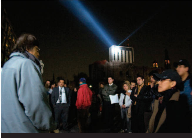
Voz Alta (Tlatelolco Memorial, Mexico City, 2008)