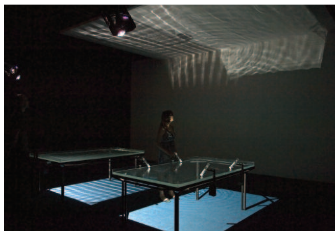
Pulse Tank (New Orleans Biennale, New Orleans, 2008)

losing its aura, the originality of the individual art object – the attraction the Mona Lisa would have to give us a unique and particular experience. What we're seeing with digital work is that the aura is back, and it's back with a vengeance. What happens is that as anybody approaches the digital artwork, the artwork will respond in a different way to this input. If an artwork is like a world or an environment, that environment is going to be read very differently by each and every participant, which means the uniqueness of that moment will be irreproducible. It will be singular. That's important because the aura is something we can manage as a vehicle to connect to people, to touch them or to ask certain questions. In the digital world, a reproduction is identical to its original. What this tells us is that it's not the actual object that in the end matters. It's the processes. ■■