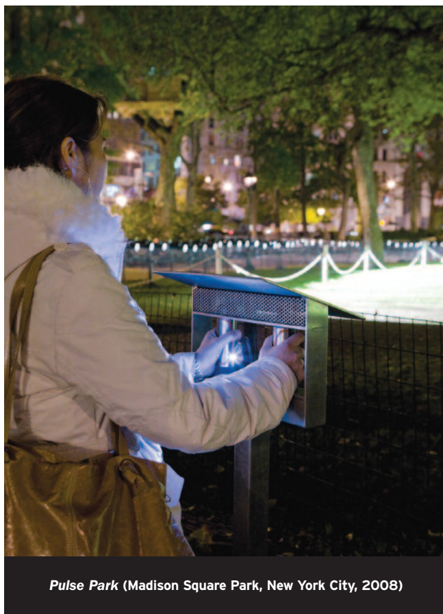
Pulse Park (Madison Square Park, New York City, 2008)

realism as any other Latin American. I'm coming more from the understanding of my work as special effects. I'm very comfortable when people see my work, and they don't necessarily think of it as art. They just say it's special effects. That's fine with me. Effectism is