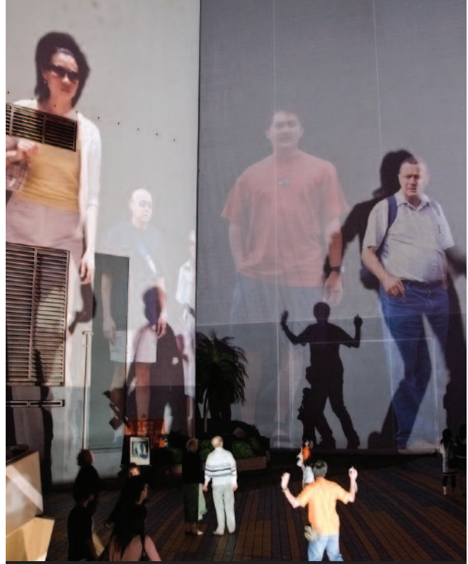
Body Movies, Relational Architecture 6 (Hong Kong, China)

After Walter Benjamin wrote The Work of Art in the Age of Mechanical Reproduction , in his opinion, artwork was