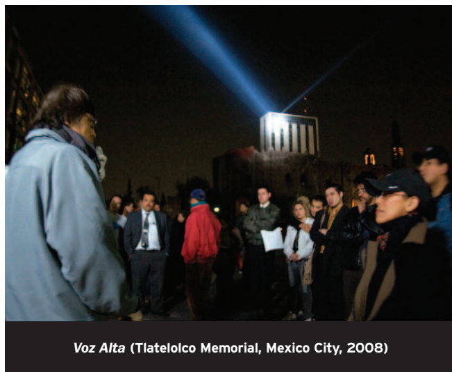
Voz Alta (Tlatelolco Memorial, Mexico City, 2008)